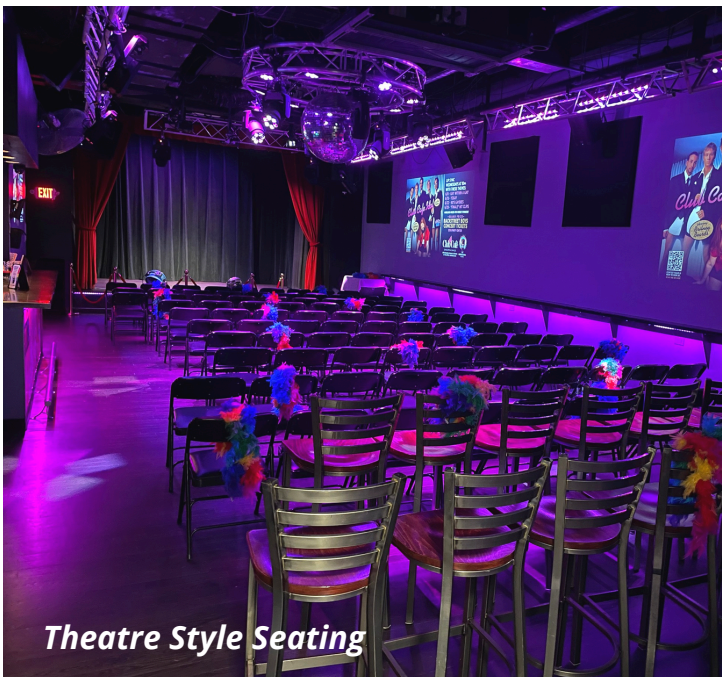
Theatre Style Seating