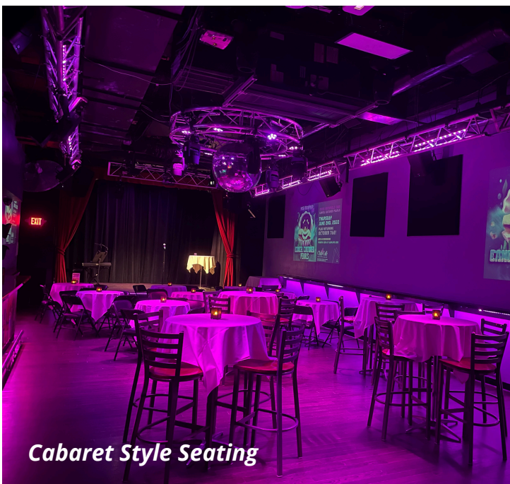
Cabaret Style Seating