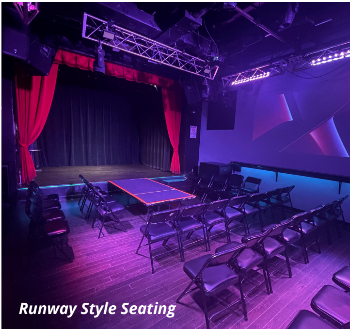
Runway Style Seating